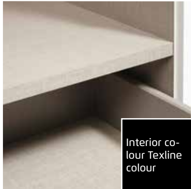
Interior colour Texline colour