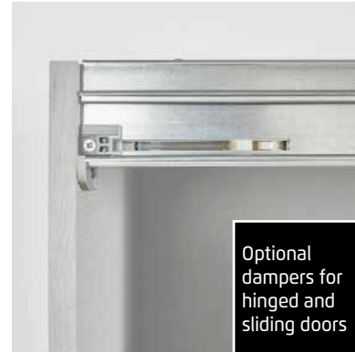
Optional dampers for hinged and sliding doors