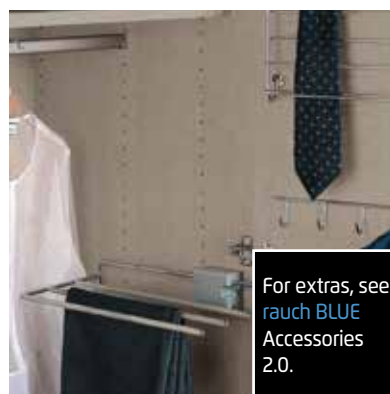
For extras, see rauch BLUE Accessories 2.0.