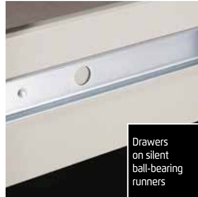
Drawers on silent ball-bearing runners