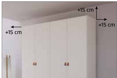
The following space is required to mount the wardrobe: wardrobe height + min. 15 cm, wardrobe width + min. 15 cm on each side.