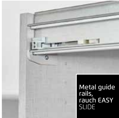
Metal guide rails, rauch EASY SLIDE