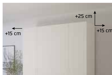
The following space is required to mount the wardrobe: wardrobe height + min. 25 cm, wardrobe width + min. 15 cm on each side.