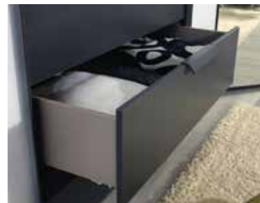
Drawers with base rail, full extension and cushioned self-closing mechanism.