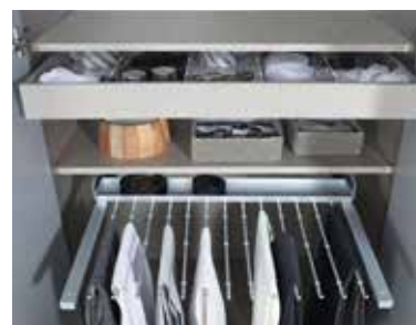
For extras, see rauch BLACK accessories retail specialist.