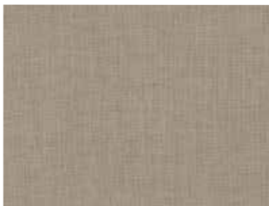
Interior colour Textline colour