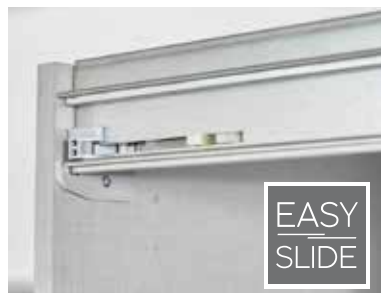
Metal guide rails, Optional dampers for sliding doors