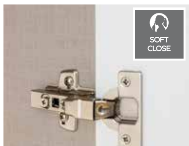
Hinged doors with soft-close