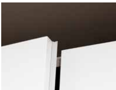
Dust brushes on the doors prevent any dust ingress.