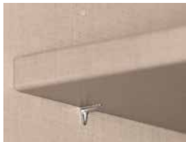
Shelf 22 mm thick, Easily adjustable thanks to plug-in angled shelf supports